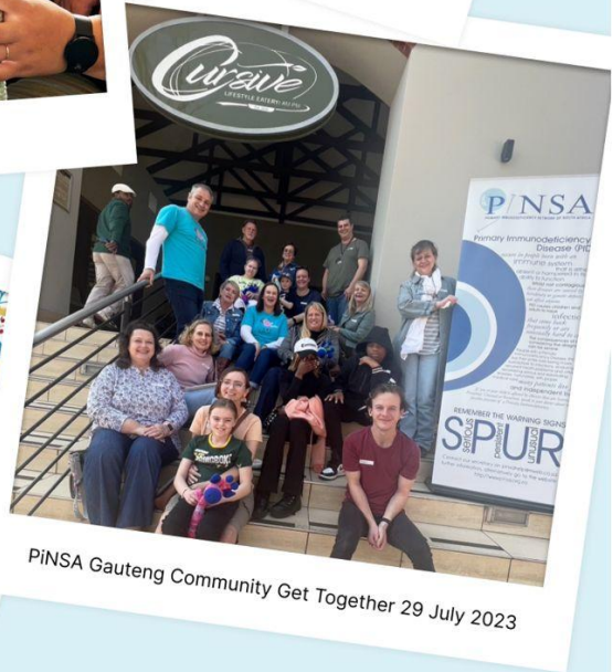
PiNSA Gauteng Community Get Together 29 July 2023